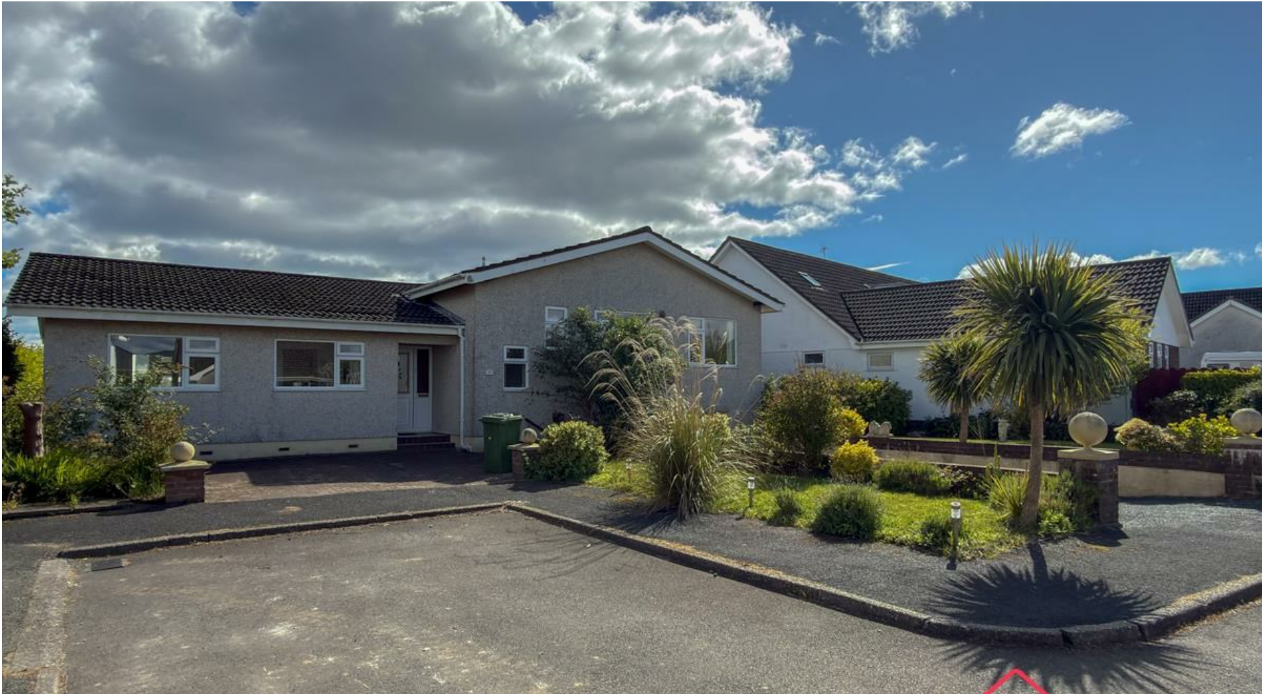
30 Fairway Close, Onchan, Isle Of Man, IM3 2EQ Asking Price £550,000